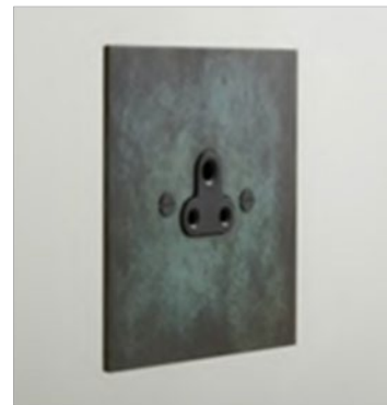
Single 5amp Socket